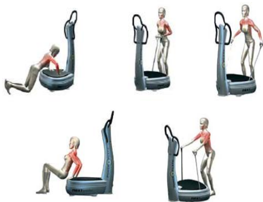
Abbildung 1: Durchgeführte Power Plate-Übungen

Die Studie zeigt, dass ein Power Plate-Training für die Oberkörpermuskulatur zu vergleichbaren Ergebnissen wie ein konventionelles Krafttraining, jedoch bei erheblich geringerem Zeitaufwand führt. Das Power Plate-Training bietet demnach eine effektive und zeitsparende Möglichkeit, die Oberkörpermuskulatur zu kräftigen.